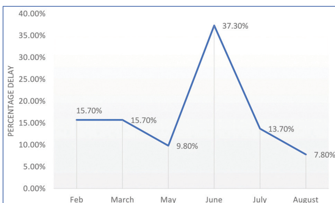
[Table/Fig-5]: Monthly distribution of delayed children.

available, more than half reported moderate to severe disruptions or total suspension of vaccination services during March-April 2020 [5]. There was a full cessation of routine Immunisations from April 1-15, 2020 in Vietnam. In Pakistan, polio catch-up Immunisation campaigns were postponed until June 1 st , 2020 [20]. The situation is quite similar to this study where Immunisation OPD was closed in April due to total lockdown.